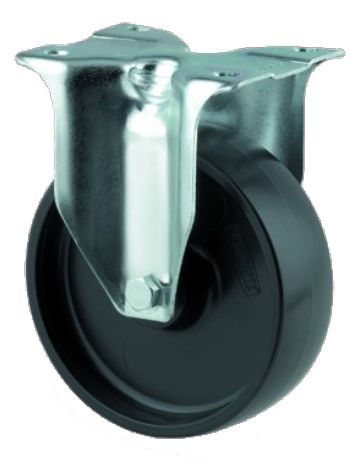
fork made of pressed steel, zinc-chromatised, wheel axle with nut

double ball bearing swivel head, dustguard, wheel axle with nut