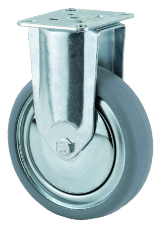
fixed castor, fork made of pressed steel, wheel axle with nut, plate fitting

double ball bearing swivel head, wheel axle with nut