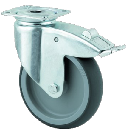
with total lock, tail end of castor, double ball bearing swivel head, wheel axle with nut