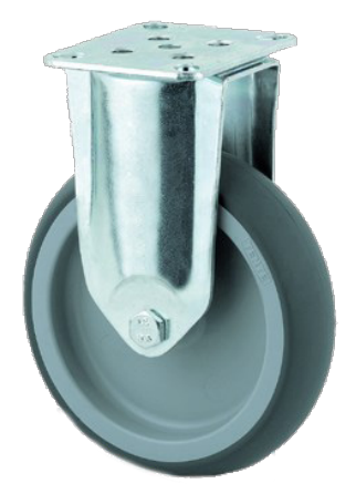
fixed castor, fork made of pressed steel, wheel axle with nut, plate fitting

double ball bearing swivel head, wheel axle with nut